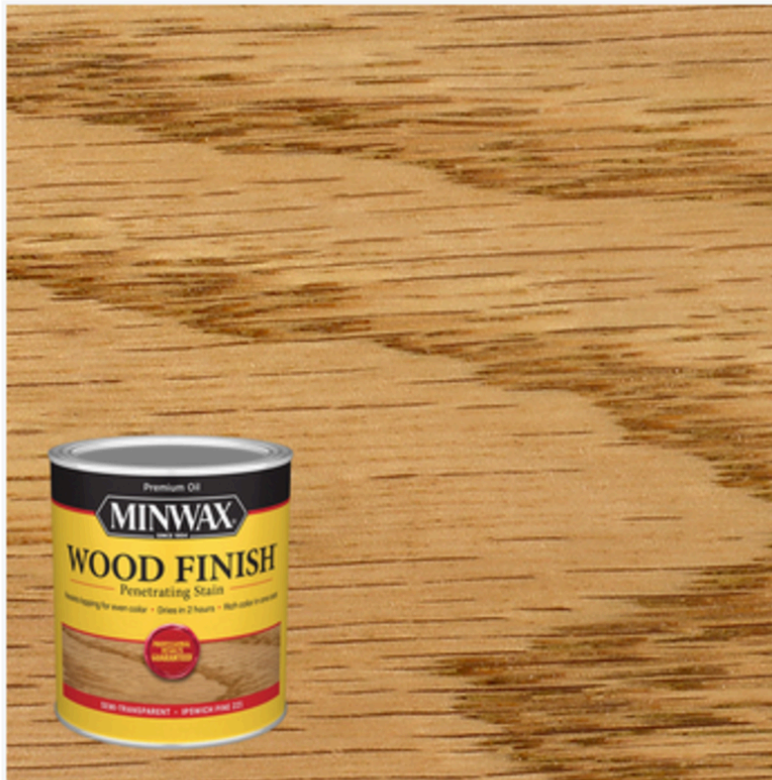
Ipswich Pine 221